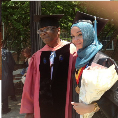
The happy faces of some