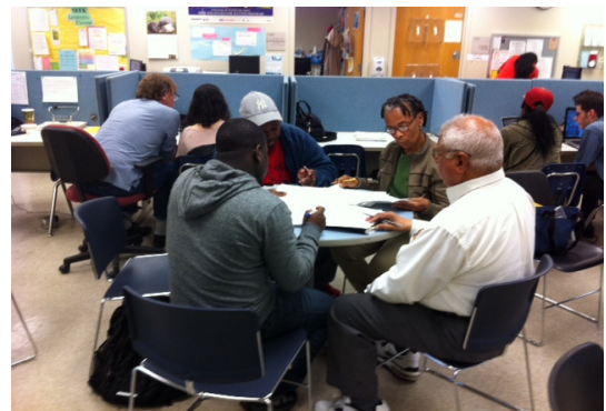
Students and tutors pack the Learning Center in preparation for finals.