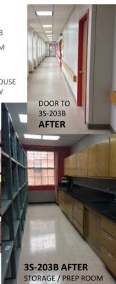
3S-203B AFTER STORAGE / PREP ROOM